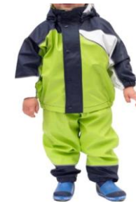
Waterproof Coat & Trousers